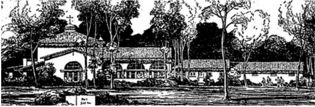
1935 sketch of the east facade of the new mission style Griffith Park golf clubhouse.

old "weatherbeaten and out-of-date field house," which was then scrapped.