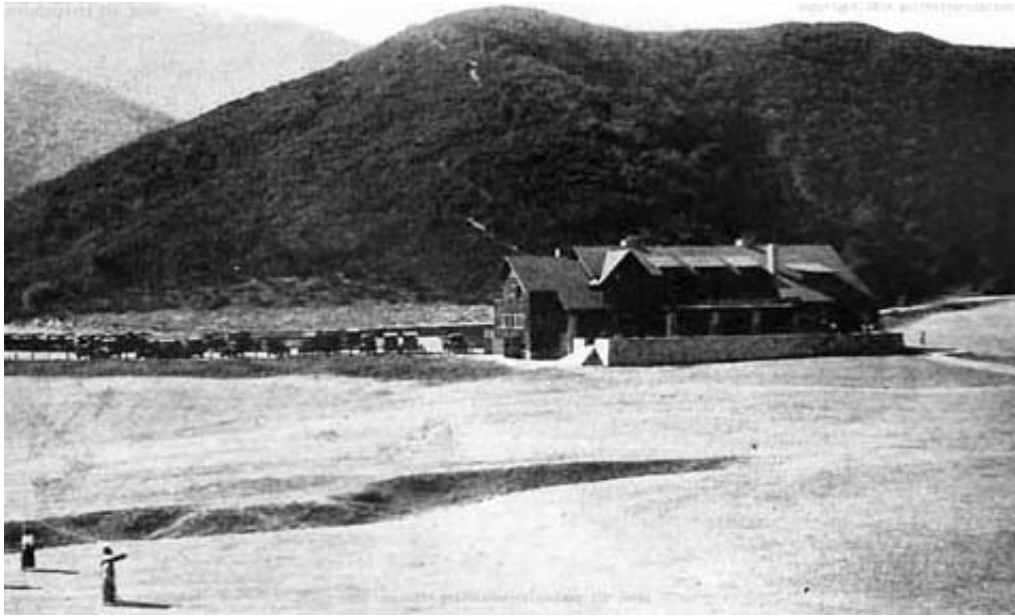
1920 photo of the east facing Griffith Park golf field house

This was the original English style Griffith Park golf field house that was funded through the city council and the Parks department budget, and was opened to golfers in May of 1918.